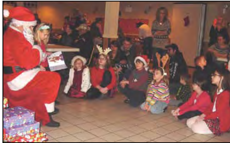
Children and parents alike listened as Santa read a story at the Dallas American Legion.

Wrapped presents were given to all of the children by Santa Claus who arrived at the party on a fire truck. Santa read a story to the children before handing out stockings and presents.